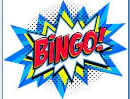
Play bingo at Netarts Fire Hall