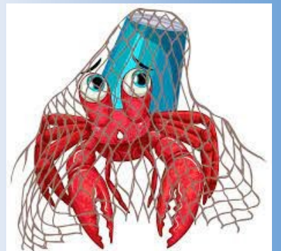
You can't beat the crabbing on Netarts Bay