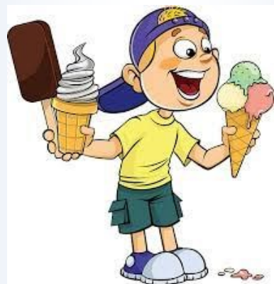
Sample the many wonderful flavors at Tillamook Ice Creamery