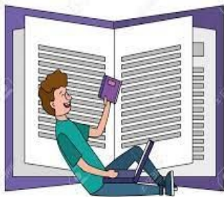
Kick back and read a good book