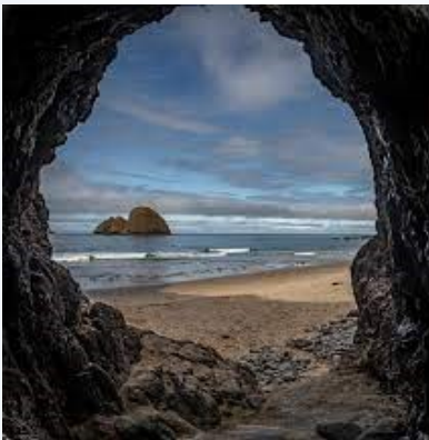
Investigate the tunnel at Oceanside