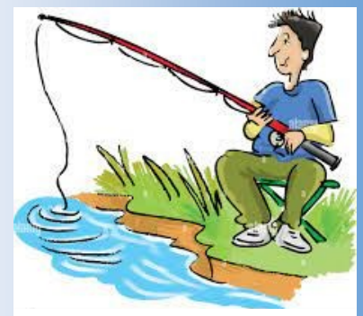
Oh yeah, and fishing