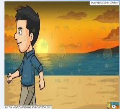
Walk the beach from Happy Camp to Oceanside or around Cape Look- out beach and trail.