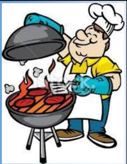
Light up the barbecue

Use a candle or a flashlight during a power outage