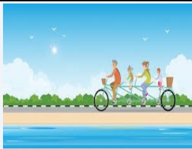
Bike along the bay or beach