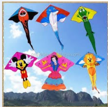
Fly a kite on a windy day