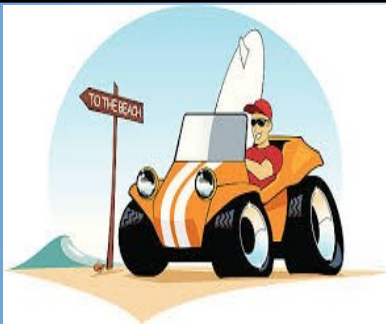
Rent a dune buggy at Sand Lake