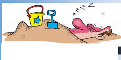
Bury a friend in the sand in the beach