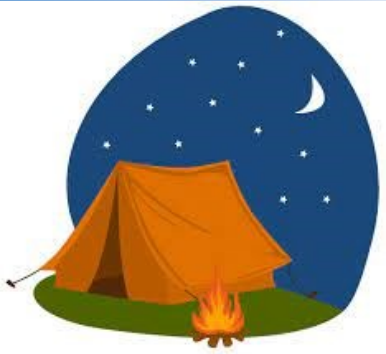
Pitch a tent and sleep under the stars.