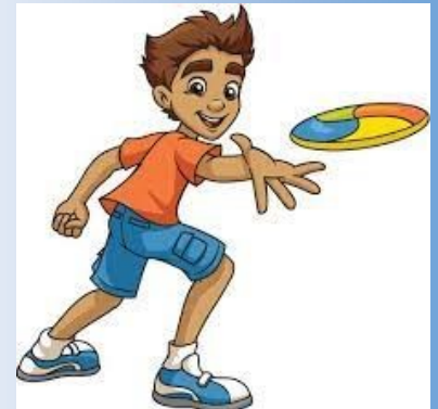
Throw a frisbee