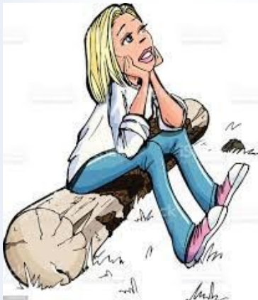
Just day dream