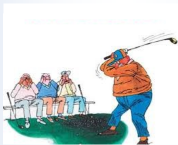
Practice golf shots out back