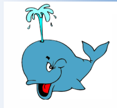
Whale watching season is typically December and January and March through May