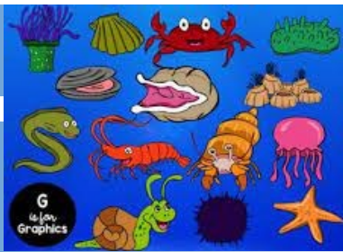
Find a tide pool