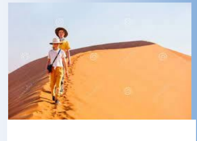
Hike the sand dunes in Pacific City