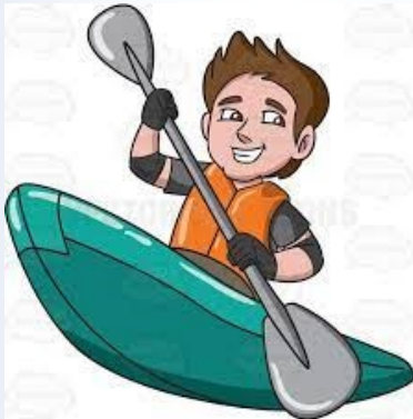
Kayak in Lake Meares