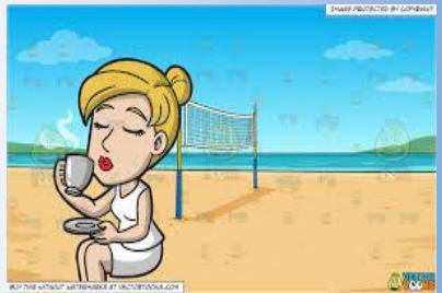
Have a great cup of coffee